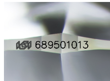
Sample Image Used